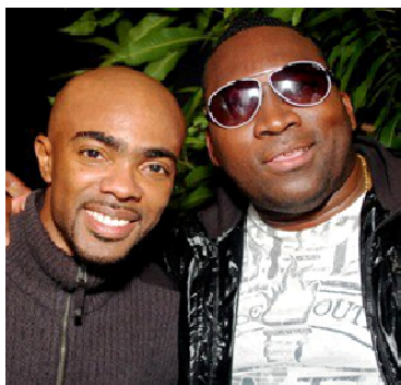
JW & Blaze

Please contact Mariella at ALTA Belmont to submit contact information on tutors and students willing to do radio and/or TV promotional ads for the 2011 literacy awareness campaign.