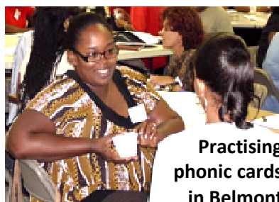
Practising phonic cards in Belmont