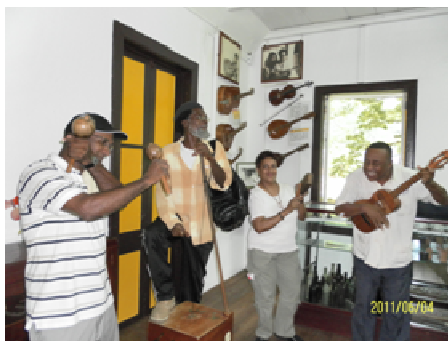
Los Paranderos de ALTA at Lopinot Historical Complex

The group then visited the Lopinot Historical Complex. There the group relaxed in the beautiful landscaped gardens and enjoyed lunch. After a presentation on the history of different musical instruments, they decided to take matters into their own hands! Soon enough they were paranging like it was Christmas morning! Perhaps ALTA should look into having parang functions with our very own ALTA Reading Circle Paranderos!